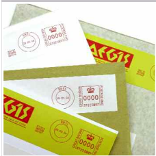
→ PROFESSIONAL IMAGE