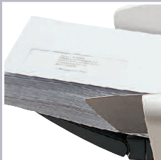
→ BUILT IN ELECTRONIC WEIGHING TRAY FOR EXACT POSTAGE EVERY TIME