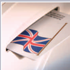
→ SMART CARD