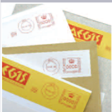
→ PROFESSIONAL IMAGE

For further details or a discussion of your individual mailing requirements, contact Franking Machine Company today on 0151 494 2525.