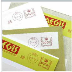
→ PROFESSIONAL IMAGE