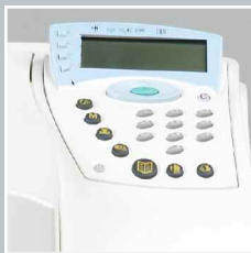
→ EASY TO USE DISPLAY