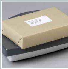
→ 3KG INTERFACED SCALE AS STANDARD

The DP41AF brings a whole new dimension to cost-effective mailroom management, with high performance features and sophisticated accounting facilities.