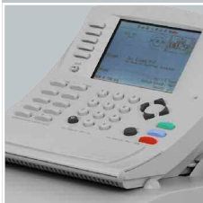
→ EASY TO USE OPERATING PANEL