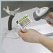
→ BARCODE SCANNER SCAN ACCOUNTS WITH BUDGET MANAGER QUICKLY AND ACCURATELY

The DP599 digital franking machine links you to a range of exclusive mail services via Intellilink® while automatically feeding, sealing, printing and stacking mail at speeds up to 160 letters a minute.