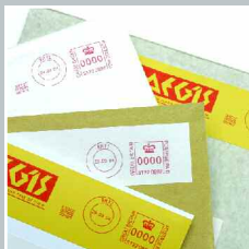
→ FAST & EASY PARCEL PROCESSING