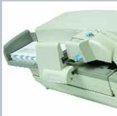
→ MIXED MAIL FEEDING

The E500 AF is a completely automatic mail processing system, which FEEDS, SEALS, FRANKS and STACKS mail in one quiet, sleek operation.