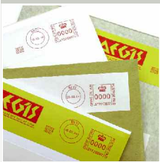
→ PROFESSIONAL IMAGE

For further details or a discussion of your individual mailing requirements, contact Franking Machine Company today on 0151 494 2525.