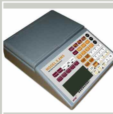
→ ADD A MODEL 5 AMS 5KG ELECTRONIC SCALE AND INCREASE THE FLEXIBILITY OF THE TM125